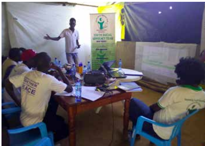
13 th April 2018