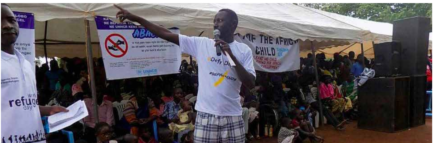
28 th March 2018

Poetry for self-expression: #Defyhatenow invited 8 primary schools and the general public during the international day of Poetry under the theme Poetry for self-expression. Performances from 8 different primary schools were staged and all focused on peacebuilding through poetry.