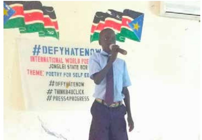
21 st March 2018

#DEFY the film tells the story of the fictional senior politician who newly found a passion for social media. The film shows an extreme misuse of social media to spread propaganda, fake news and rumours. The #DEFY film was produced aimed to raise awareness and facilitate dialogue about how we can work together in our communities to address these risks and mitigate further incitement to violence arising through online hate speech.