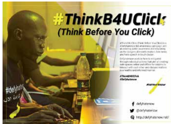
6 th April, 2018

Refugee Leaders from 7 Villages in Rhino camp will be trained on how to identify, create awareness and mitigate Hate Speech in their leadership capacities in the Clusters, Churches, Women Forums and community gatherings/meetings for greater reach and impact to the Community in their daily work. It will involve 21 Refugee Leaders in various capacities to gain knowledge on hate speech mitigation.