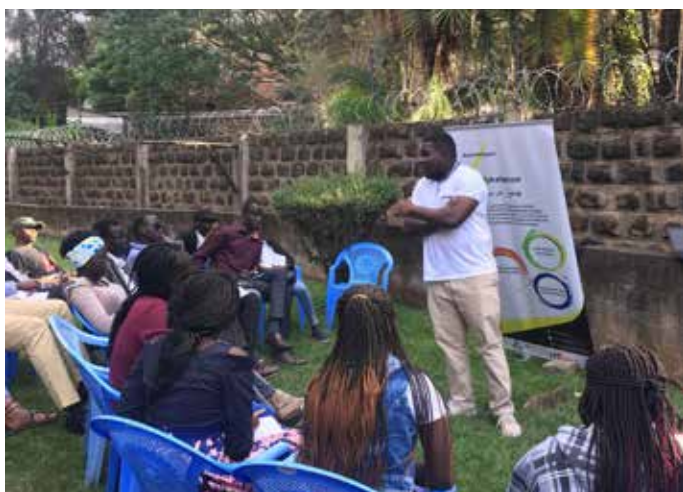
14th Nov. 2018