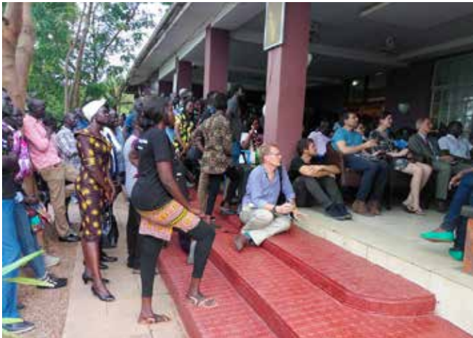
1 st March 2018