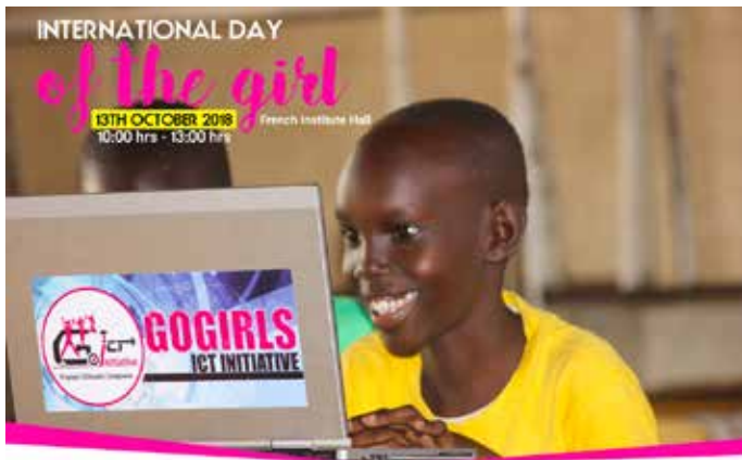
13rd October 2018