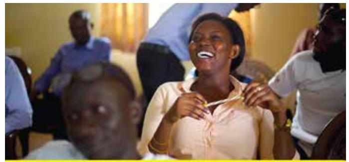
9th October 2018

Today's generation of girls are preparing to enter a world of work that is being transformed by innovation and automation. Educated and skilled workers are in great demand, but roughly a quarter of young people – most of them female – are currently neither employed or in education or training according to United Nations. Transferable skills – such as self-confidence, problem solving, teamwork and critical thinking – are critical to succeed in the rapidly changing world of work, yet many schools do not focus on these “21st century skills,” including STEAM (Science, Technology, Engineering, Arts and Math) education.