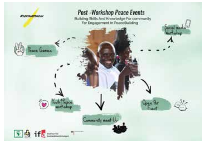
15th November 2018